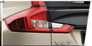
LED Taillamps with Vertical Guide Lights