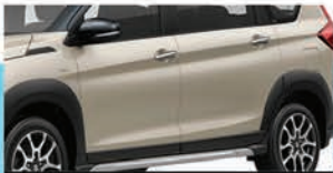
Side Protection Moulding