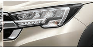
LED Headlamps with DRL