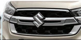
New Grille Design